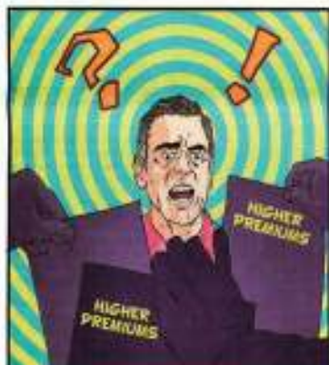
COSTS COULD CLIMB ONCE YOU HAVE COVERAGE.