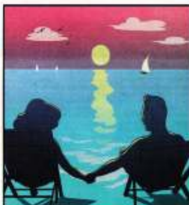
THE PAYOFF: PEACE OF MIND AND ASSET PROTECTION