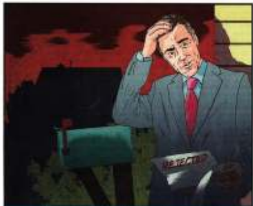
FINDING A POLICY IS GETTING HARDER.

MOST EXPERTS SAY LONG-TERM-CARE INSURANCE IS A MUST-HAVE—BUT COSTS ARE RISING AND RESTRICTIONS ARE GROWING. HERE'S HOW TO SECURE THE RIGHT PROTECTION